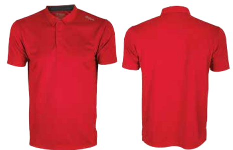
TT 0105 Red