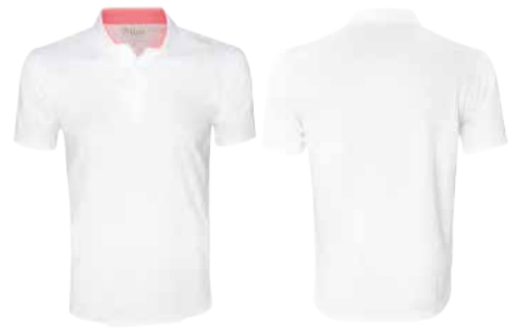
TT 0100 White