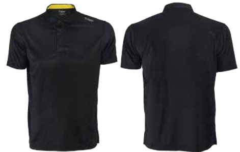
TT 0102 Black