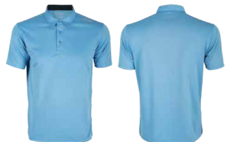
TT 0128 Medium Blue