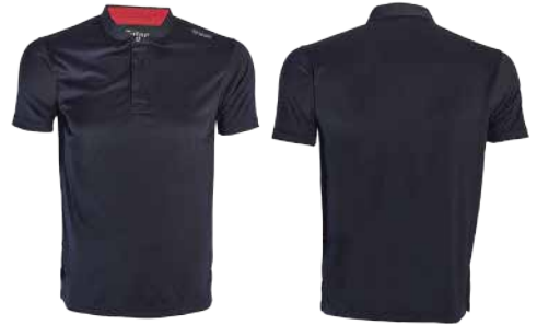
TT 0101 Navy